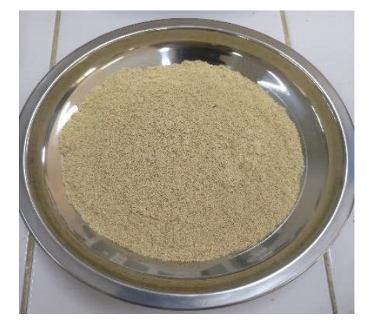
Fig. 1. Pulverized rice husk.

The agro-wastes were collected from nearby fields or plantations and thoroughly cleaned. Rice husk, coconut husk, and corn husk shown in Figure 1, Figure 2, and Figure 3, respectively were sun-dried before undergoing pulverization. Rice husk was pulverized using a specialized machine, while coconut husk and corn husk were pulverized using a blender.