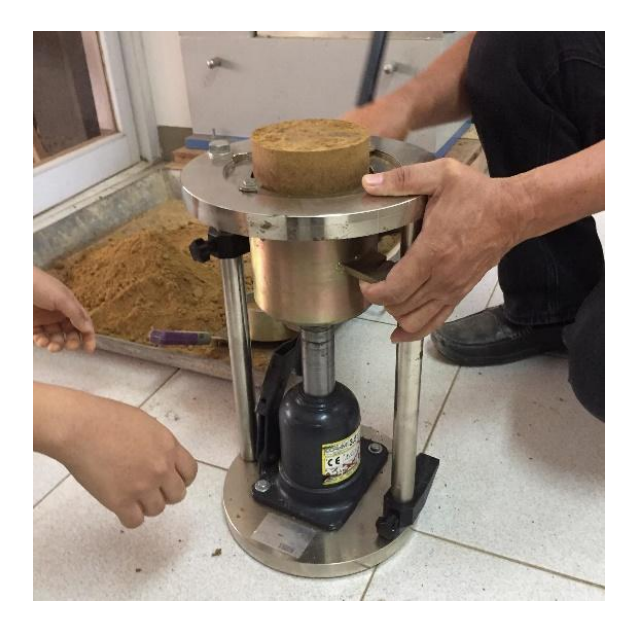
Fig. 6. Extruder Machine