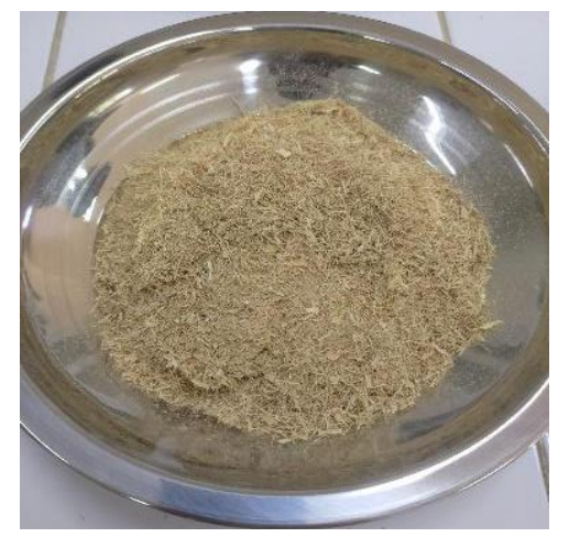
Fig. 3. Pulverized corn husk.