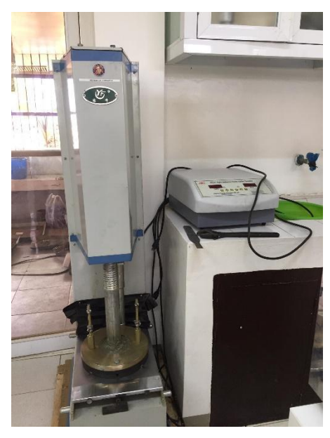
Fig. 5. Digital Compactor Machine