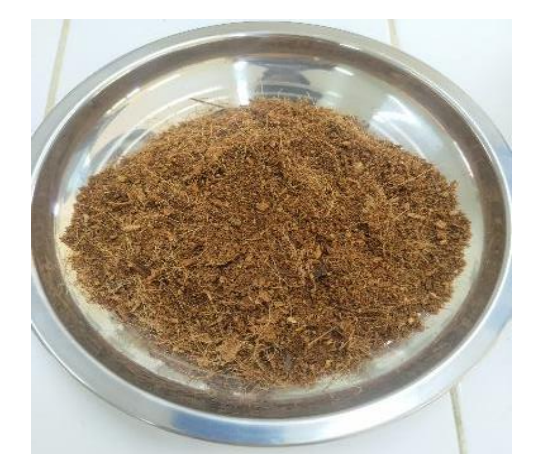
Fig. 2. Pulverized coconut husk.