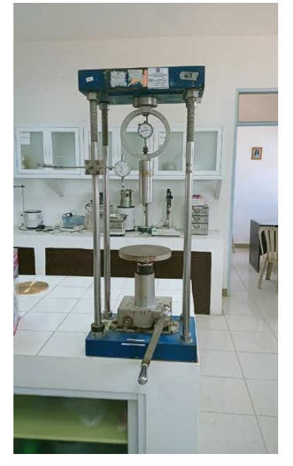
Fig. 4. California Bearing Ratio Machine

The Standard Proctor Test was performed with the aid of the digital compactor shown in Figure 5 and extruder shown in Figure 6 to estimate the maximum load-bearing capacity of the soil and assess compaction characteristics as moisture content varies. The Standard Proctor Test, as described in AASHTO T-99, can be used to establish the Optimum Moisture Content (OMC) and Maximum Dry Density (MDD) values.